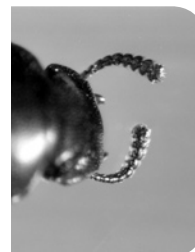
Confused Flour Beetle