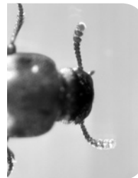
Red Flour Beetle

A sanitation program combined with a customized pest management program is essential in the fight against one of the most formidable enemies of the food industry—the Flour Beetle. ●